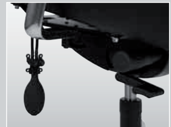
Maintenance friendly mechanism, plus robust materials and cover fabrics (higher demands from use in automotive applications)