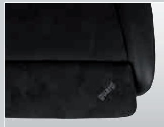
Extendable seat cushion for optimum distribution of pressure on backside and thighs